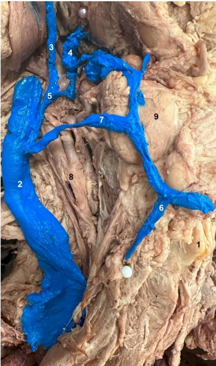
Figure 2. Right head and neck venous system, 1 — thyroid cartilage, 2 — internal jugular vein, 3 — retromandibular vein, 4 — facial vein, 5 — common facial vein, 6 — anterior jugular vein, 7 — communicating vein between IJV and AJV, 8 — common carotid artery, 9 — submandibular gland.