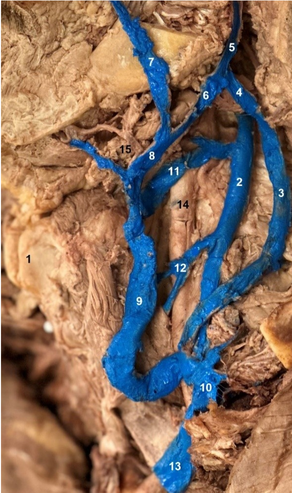
Figure 1. Left head and neck venous system, 1 — thyroid cartilage, 2 — internal jugular vein, 3 — external jugular vein, 4 — posterior division of retromandibular vein, 5 — retromandibular vein, 6 — anterior division of retromandibular vein, 7 — facial vein, 8 — common facial vein, 9 — anterior jugular vein, 10 — subclavian vein, 11 — communicating vein between IJV and AJV, 12 — common trunk of superior and middle thyroid veins, 13 — brachiocephalic vein, 14 — common carotid artery, 15 — submandibular gland.